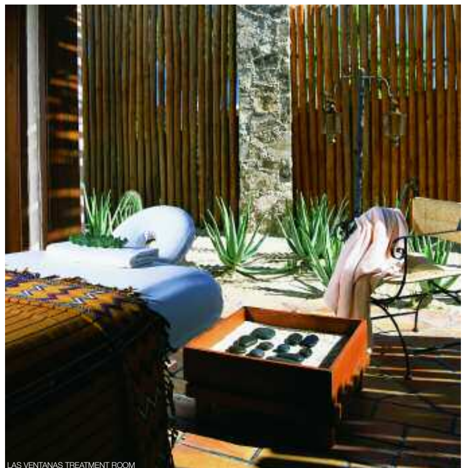
LAS VENTANAS TREATMENT ROOM