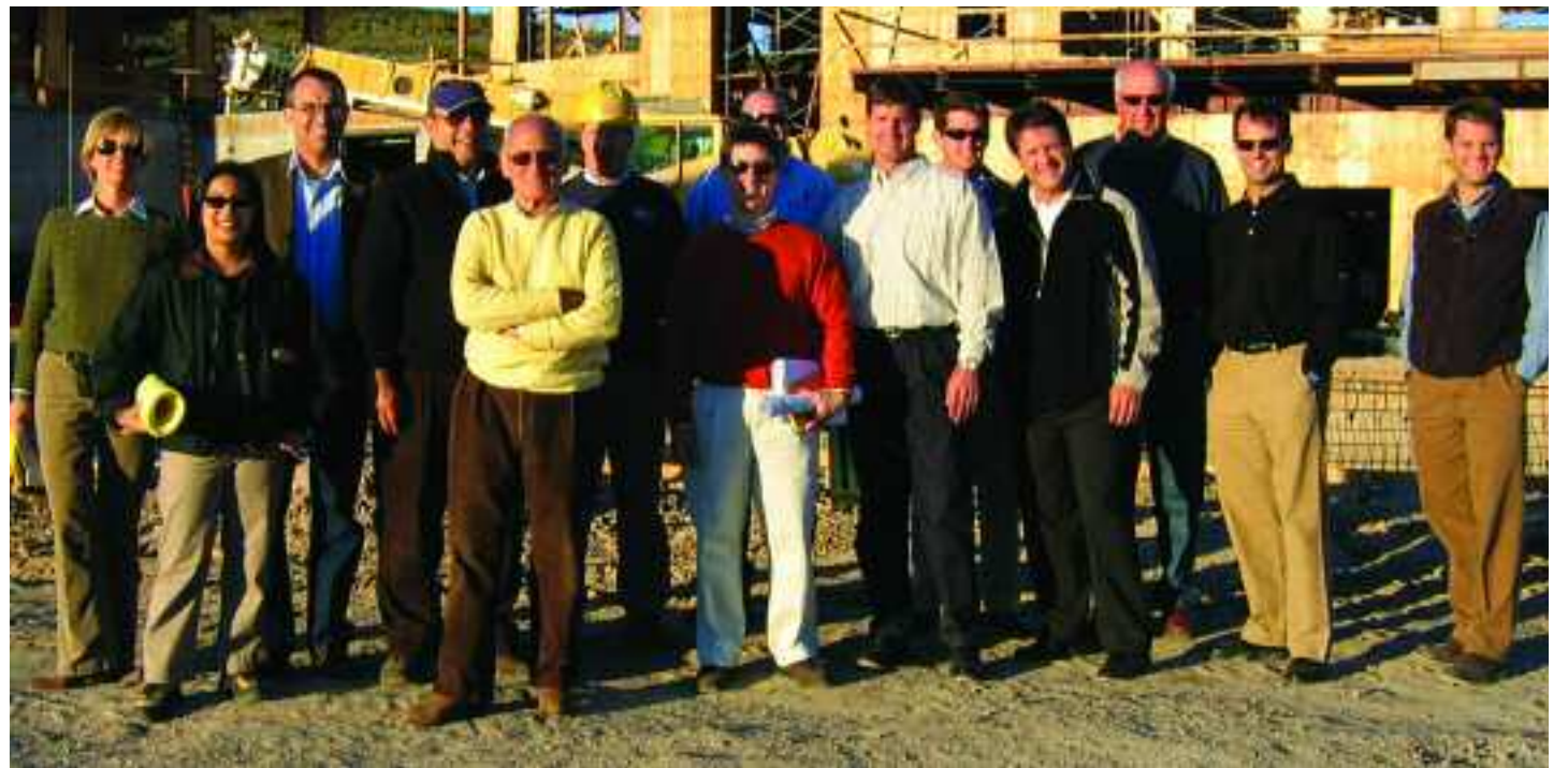
Architect Robert Stern (front, left, wearing yellow sweater) and members from his architectural team meet up with Talisker Club team members during a visit to Tuhaye Park in October.

The pool, which will be heated for year-round use, is under construction and will feature an ancillary family play area with a water slide. A second pool is planned for adults only and will include a hot tub, two lanes for lap-swimming and horizon-edge elements to best highlight the gorgeous views of Deer Valley Resort and Mt. Timpanogos.